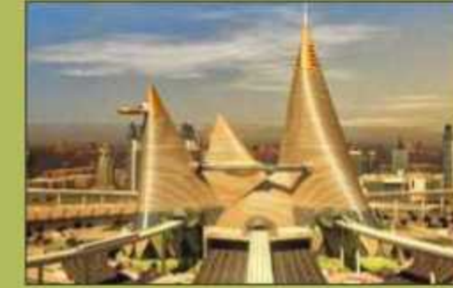
DHOLERA CITY CENTER 7 km. (approx)