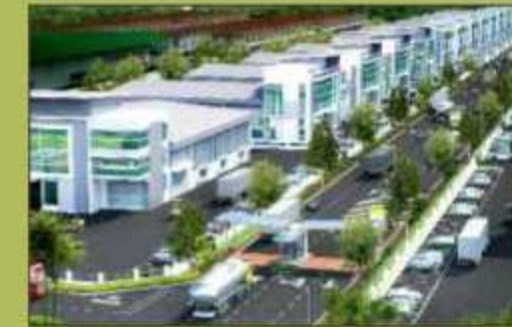
INDUSTRIAL ZONE 2 km. (approx)