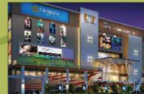
CITY CENTER 4 km. (approx)