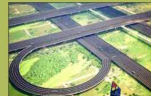
DMIC 10 LANE HIGHWAY 8 km. (approx)