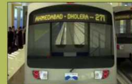
METRO RAIL STATION 5 km. (approx)