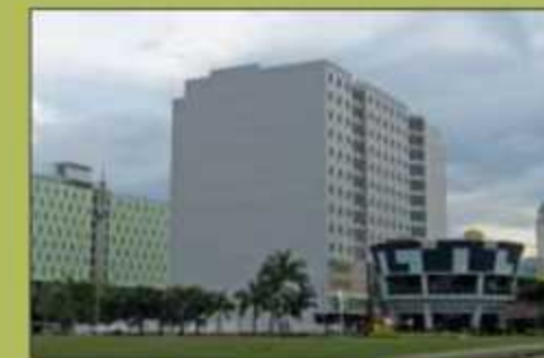
IT & KNOWLEDGE 6 km. (approx)