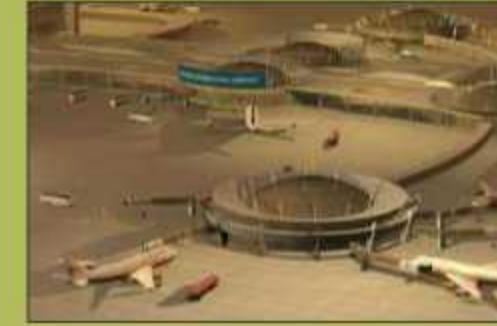
GREEN FIELD INTERNATIONAL AIRPORT 22 km. (approx)