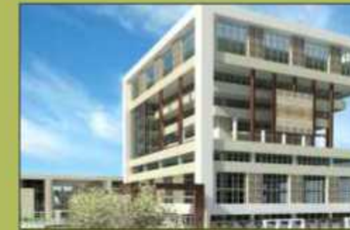
ABCD BUILDING 8 km. (approx)